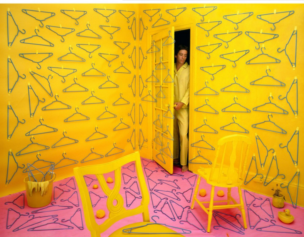
Photographer Sandy Skoglund builds large, complex stage sets as seen in Hangers (1979). Her works use repetition and color to create surreal dream-like scenes. Notice how the careful placement of the objects on the floor playfully distorts the perspective of the room.