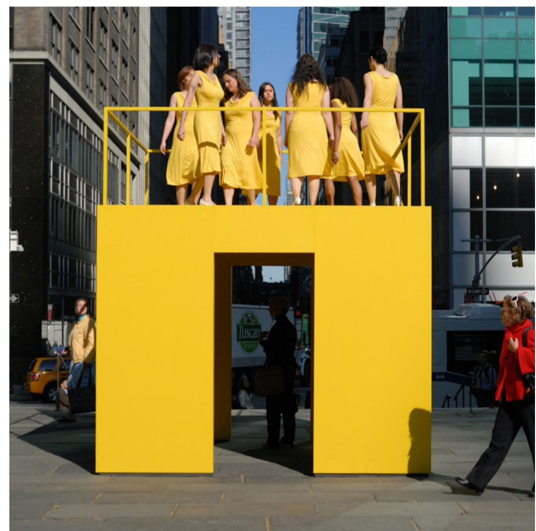
Kate Gilmore is a performance artist who creates events rather than permanent objects. In Walk the Walk (2010), a group of identically dressed women walked for 8 hours atop a large cube essentially putting the common act atop a pedestal. Viewers could stand underneath and hear the sounds of footsteps. Works like Gilmore's encourage viewers to think of ordinary things in new and different ways.

Said to be the favorite color of painter Vincent van Gogh, yellow is one of the three primary hues. Here, yellow is unifying element that connects the diverse creative approaches of these contemporary artists.