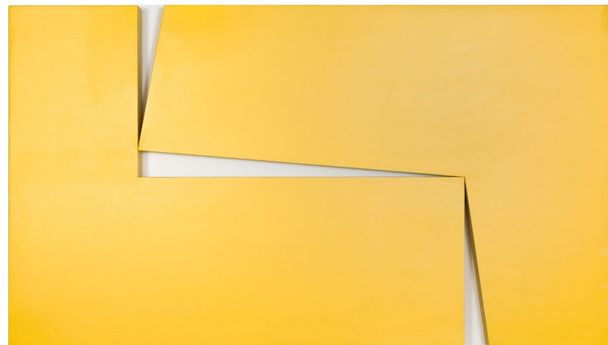
Cuban-American painter Carmen Herrera is a Minimalist. Her works contain simple, yet bold visual elements. In i>Amarillo Dos (1971), she uses only two yellow wood panels, but the negative space between them creates three thin triangles.