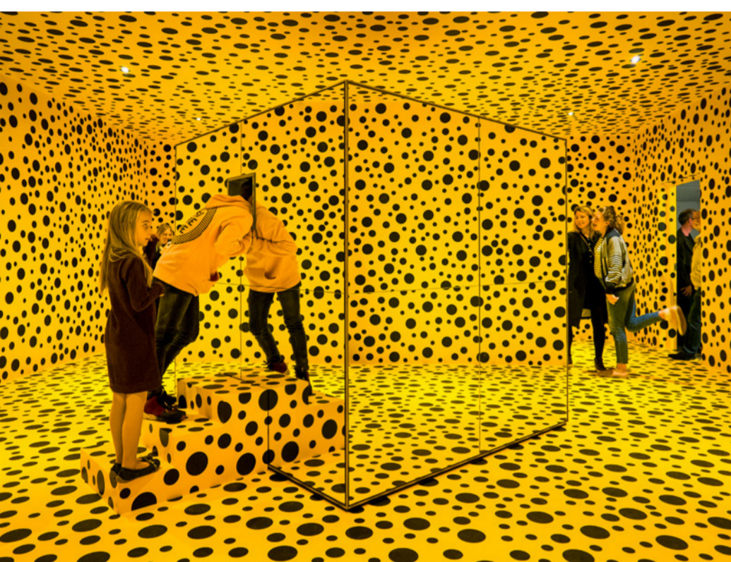
Japanese artist Yayoi Kusama creates installations that you can walk into. Using all-over patterns and mirrors, her Infinity Rooms transform the gallery space into a visually complex funhouse.