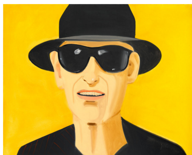
Painter Alex Katz creates figurative art emphasizing simplified form and flat color. This undated self-portrait displays his stylized approach to realism.